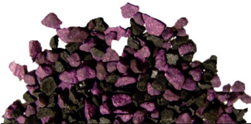
PERRY MAXSORB ULTRA BLEND MEDIA