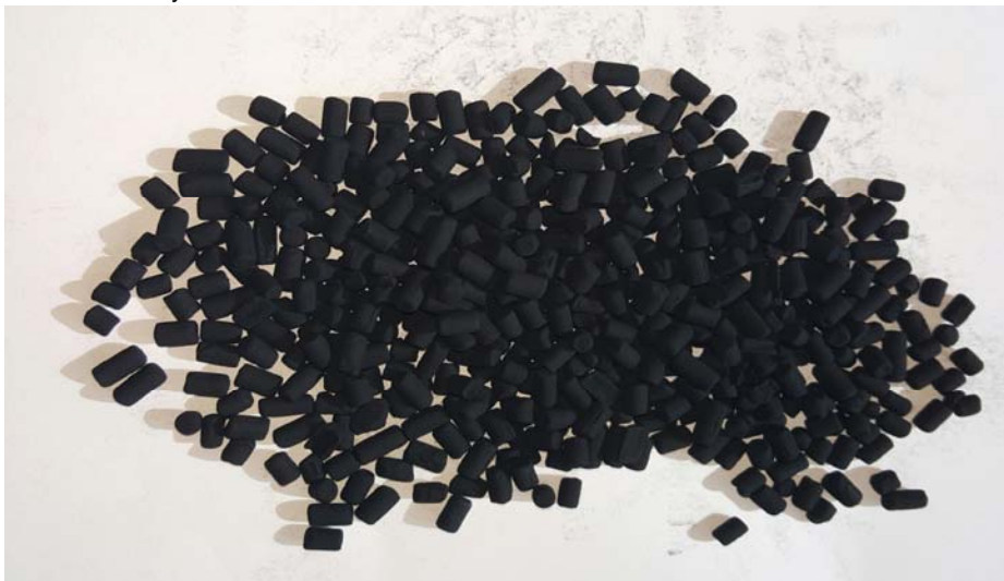
PERRY MAXSORB CO-PA 60-HS-0.3 MEDIA